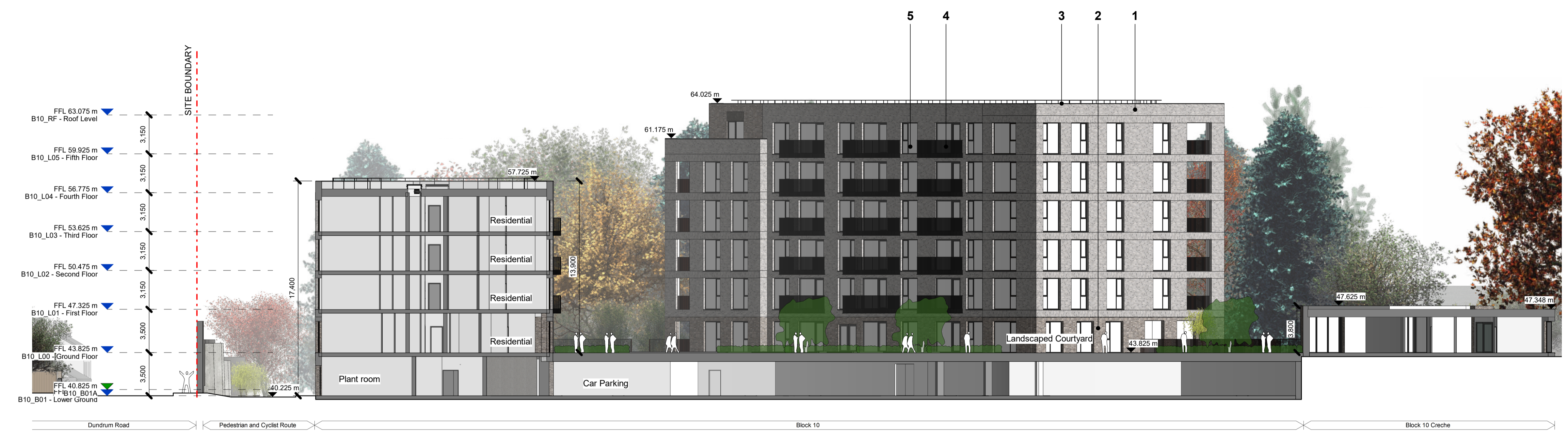
Section 01 1 : 200