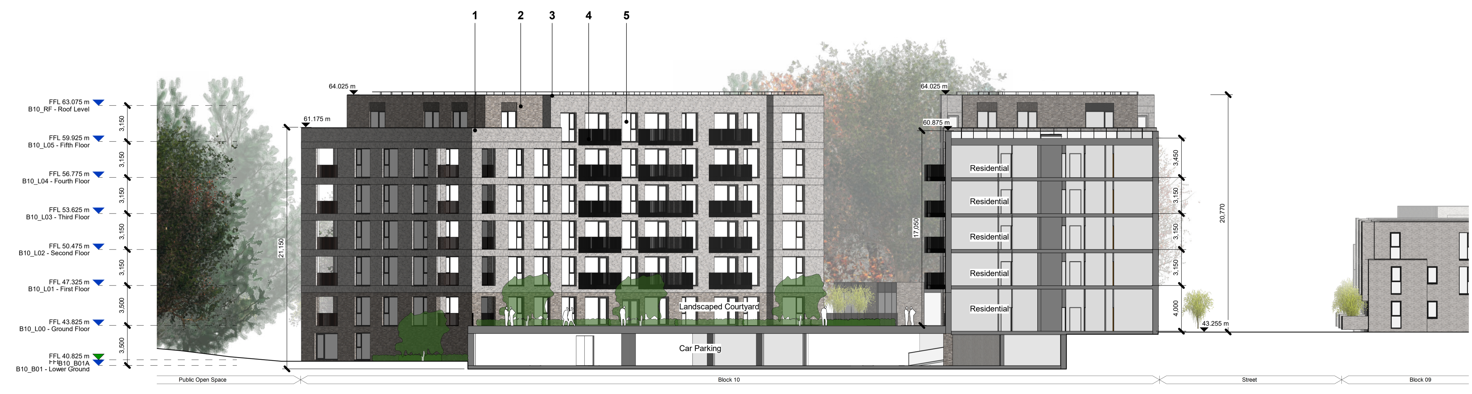
Section 02 1 : 200